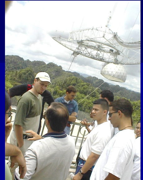
Students of antenna course visiting Arecibo Observatory.