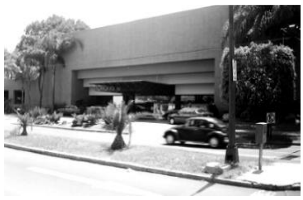
View of Guadalajara's Club de Industriales, site of the CoHemis-Caterpillar short course on Sanitary Landfill in August, 1996.

Its goal is to enable engineering and science professionals to produce their first EIAs with satisfactory results. It will present